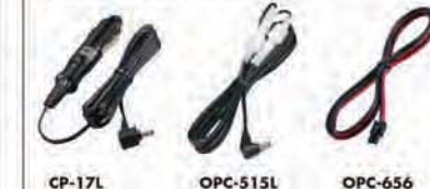
CP-17L OPC-515L OPC-656

CP-17L : CIGARETTE LIGHTER CABLE For use with BC-119N and BC-152. OPC-515L: DC POWER CABLE For BC-119N and BC-152. OPC-656 : DC POWER CABLE for BC-121N.