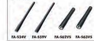
FA-S24V FA-S59V FA-S62VS FA-S63VS

ANTENNAS FA-S24V : 136–150MHz (Blue) FA-S59V : 150–174MHz (Red) STUBBY ANTENNAS FA-S62VS: 150–162MHz (Red, 90mm) FA-S63VS: 160–174MHz (Green, 90mm)