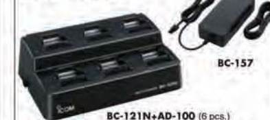
BC-121N+AD-100 (6 pcs.) BC-157

BC-121N MULTI-CHARGER + AD-100 CHARGER ADAPTER + BC-157 AC ADAPTER Rapidly charges up to 6 battery packs (Six AD-100s are required) in 2–2.5 hrs.